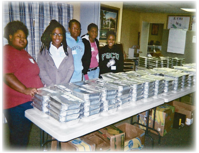
FGCU students feed the needy Thanksgiving morning.