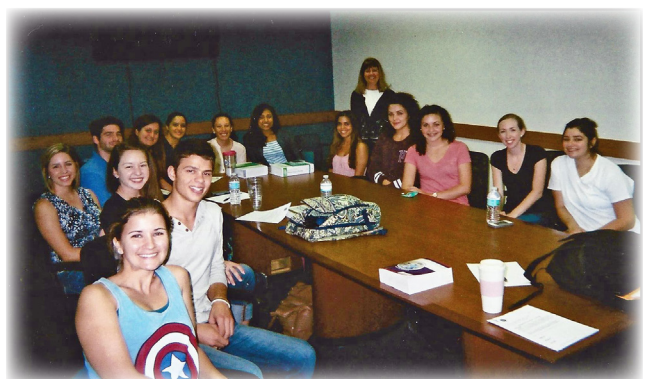
NCF students gather to pray and plan outreach.