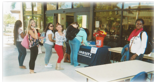
Students line up for roses and Gospel messages at Rose Outreach 2015 on campus.