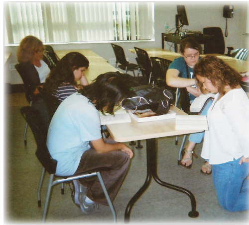
InterVarsity students studying the Bible on campus.